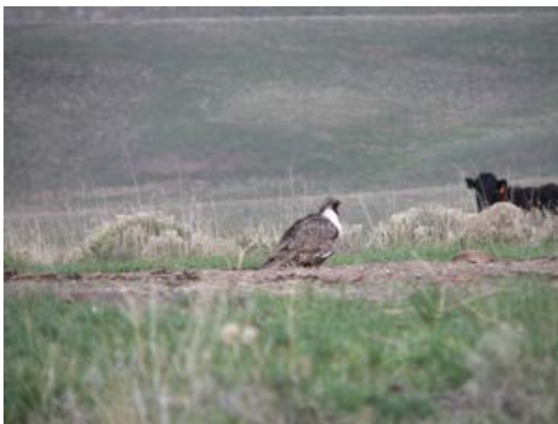
Figure 1. Sage-grouse range is often also grazed by livestock.

Annually, the seasonal flush of nutrient rich vegetation in the Intermountain West that tracks both temperature and moisture up mountain slopes has become known as the “green wave.” Research has reported that native ungulates, such as mule deer and elk, follow this green wave of abundant food. Both mule deer and sage-grouse appear to synchronize birthing and nest initiation to match the period half way between the start of spring and the peak of the growing season, which provides highly nutritious food that is increasing on a daily basis. In Utah, sage-grouse