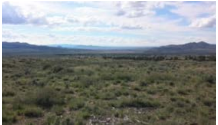
Photo to the left shows conifer mulch left after brush-hog treatment. Photo above shows the Sheeprocks area.