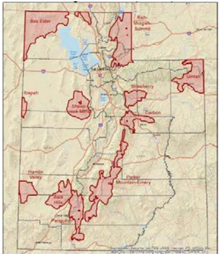
Map of Utah's Sage-grouse Management Areas.