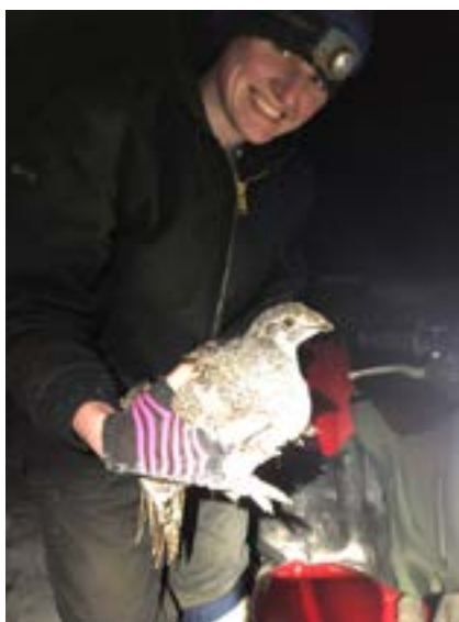
Figure 2. We are monitoring female sage-grouse radio-marked with global-positioning satellite transmitters to determine how they respond to livestock and grazing.

200,000 acre private ranch located in northeastern Utah, combined sagebrush treatments with a high-intensity-low frequency rest and deferred-rotation grazing system. Preliminary data suggested that the increase in forbs and grasses following range treatments provided greater forage for livestock, but may have also improved sage-grouse brooding habitat. Nesting sage-grouse depend on forbs and insects during the incubation period, and newly hatched chicks are almost entirely dependent on these same food items until approximately 6 weeks of age. What remains to be determined is whether the intensity and duration of grazing has facilitative or competitive relationships with sage-grouse especially during the critical brood rearing life phase.